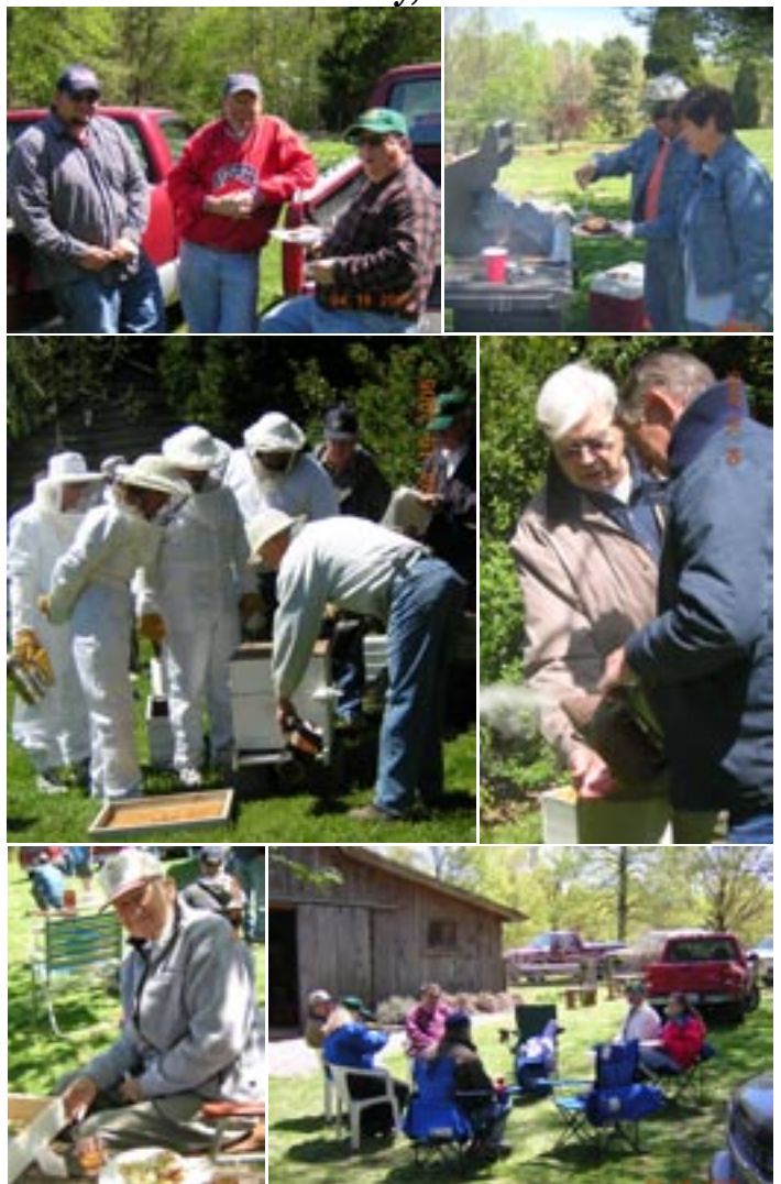
Field Day, 2005

Like to join Guilford County Beekeepers Association? Meetings are held on the 2nd Tuesday of each month. (Odd months @ 6:30 p.m. with a covered dish meal, even months @ 7:00 p.m.) Just come to our next meeting at the Guilford County Agricultural Center and join in. Dues are $25.00 per year (that's $10.00 for GCBA and $15.00 for expanded membership in the North Carolina State Beekeepers Association).